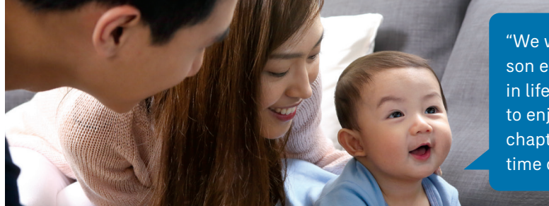
"We want to give our son every opportunity in life, but still be able to enjoy our second chapter when the time comes."

You want to achieve it all and live life on your own terms. As you strive to realise your passion and plan the next travelcation, dream wedding or hipster home, you want a plan that gives you an edge from the get-go, so your money works as hard as you do.